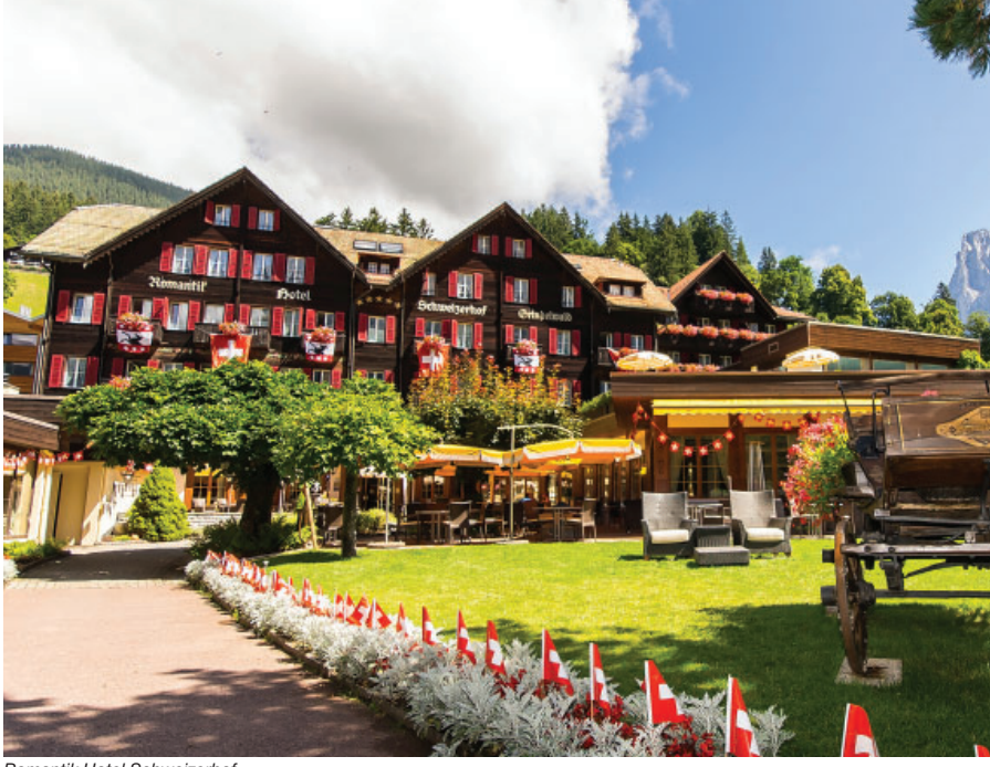
Romantik Hotel Schweizerho

bar to create the warm, welcoming feel of a mountain lodge. The Schweizerhof Spa is a chic haven of tranquillity, centred around the relaxing pool. Whirlpools and saunas, with atmospheric mood-lighting, are tucked into steamy corners, and indulgent massages and beauty treatments are administered in private treatment rooms. With two different hotel styles, which both channel two aspects of Swiss culture, the Romantik Hotel Schweizerhof has something to offer each of its guests. Luxurious accommodation, food, and spa facilities come together to create a truly special five star hotel.