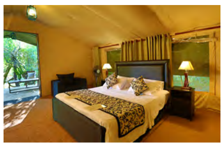
Leopard Trails, Yala National Park