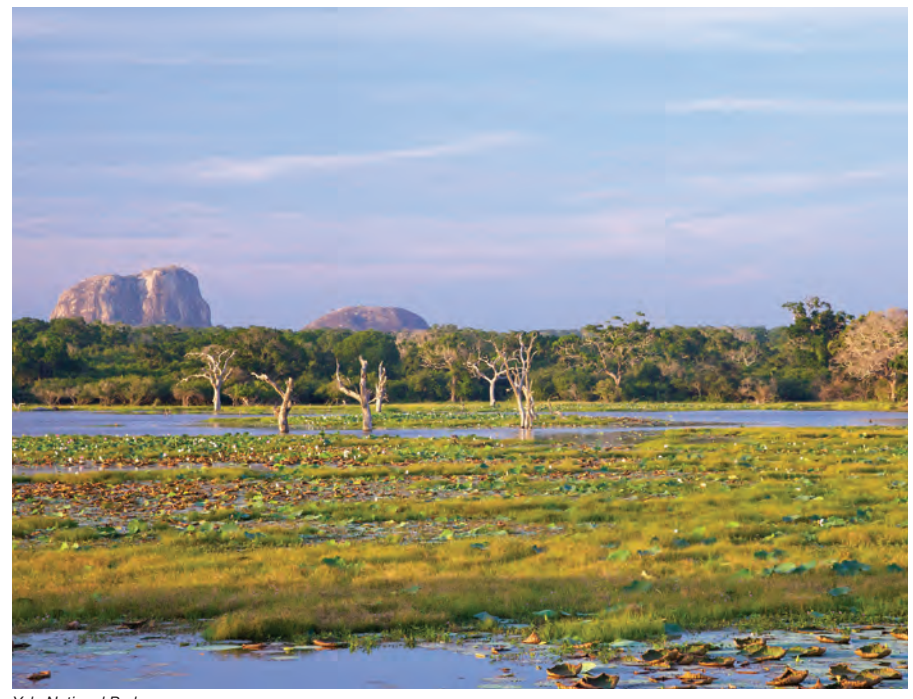
Yala National Park

Today you will depart for Yala National Park, Sri Lanka's most visited national park. Enjoy the mountain scenery on your journey and witness these mountains dramatically drop down to the plains off the south, continuing to the south east coast. En route you can visit Uda Walawe National Park (approximately 4 to 5 hours drive). Uda Walawe is best known for its elephants and with a population of around 400, you are virtually guaranteed to see them in the wild. This is mostly hot, dry terrain where the watering holes are a magnet for wildlife. There is an Elephant Transit Home near the entrance to the national park (separate fee), where you can see young elephants roaming free in a large field, and flocking into the feeding enclosure for meal times.