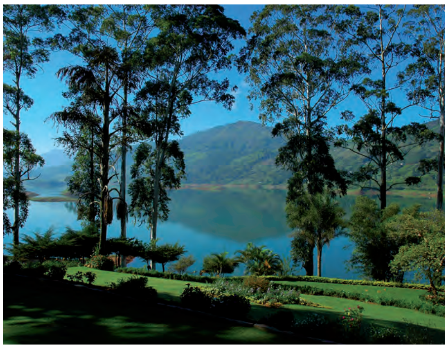
Ceylon Tea Trails, Tea Country

mouth-watering dishes flow seamlessly throughout the day, giving you plenty of opportunities to try the local specialities. A menu of relaxing and rejuvenating in-room spa treatments and aromatic baths has also been introduced. read more