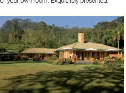
Ceylon Tea Trails, Tea Country

Ceylon Tea Trails lies at an elevation of 4,000 feet in the Golden Valley of tea. The four classic colonial bungalows were built for British tea estate managers and have been sympathetically restored to offer the unique experience of life on a tea estate. Each Tea Trail estate bungalow is set in beautifully landscaped gardens filled with colourful, fragrant flowers and carefully manicured lawns. The bungalows are elegantly furnished with the finest cloth, soft Chinese rugs, and weathered teak floors. Living rooms warmed by roaring log fires house old books, antique maps, and soft armchairs. The bedrooms are spacious, with comfy chairs and beds, and a discreet butler is at your beck and call. Afternoon tea is served on the lawns in fine weather with a unique and devoted tea menu. The chef discusses all meals and mealtimes individually with guests, and you can enjoy your meal in the dining room, garden terrace, or your own room. Exquisitely presented,