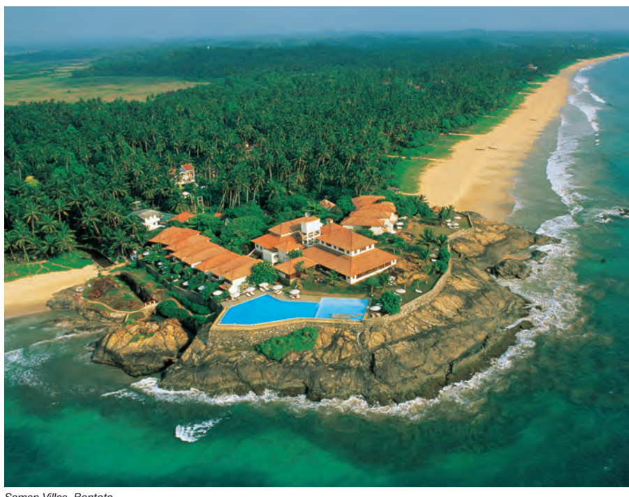
Saman Villas, Bentota

Dating back over 400 years, the luxurious Amangalla hotel sits within the rampart walls of historic Galle Fort. This glorious colonial building became the New Oriental Hotel in 1863 and has remained at the hub of life in Galle since. Having been beautifully restored, the hotel re-opened in 2004, offering 29 bedrooms, fine dining, and the excellent service of all Aman hotels. At the entrance lies a long white veranda, a favoured place for watching the world go by over afternoon tea. This leads through to the Zaal, a great hall with high ceilings, a grand piano, and magnificent chandeliers. Splendid international, Sri Lankan and fusion cuisine is served in the adjacent Dining Room, replete with crisp white linen and antique silverware. All of the 29 rooms are appointed with four-poster beds, polished teak or jack wood floors, planters chairs, and pettagama chests. Some rooms have a balcony or French windows opening onto the garden, whilst the Suites have their own separate living rooms. Guests can relax in the pretty, peaceful gardens and by the swimming pool, sleeping in the shaded 'ambalama,' or lounging in the sun. 'The Baths' Spa provides a perfect place to unwind in between your forays around Galle, offering a hydrotherapy pool, sauna, steam and cold plunge pools as well as Ayurvedic treatments. read more