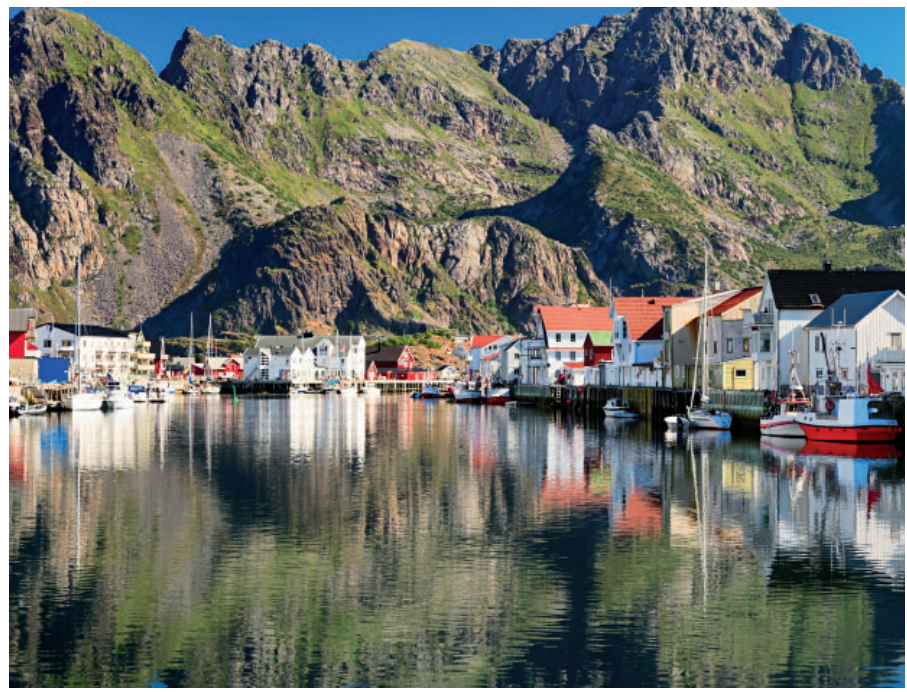
Henningsvaer Lofoten Islands

Tromsø is known by many as the Arctic capital, and for good reason. With its plethora of activities and interesting activities, there is something to do here for everyone. The city is perhaps best-known for being an excellent location to see the Northern Lights. The Polar Night, from mid-November to mid-January, is the best period to witness this extraordinary natural phenomenon, as the sun never rises above the horizon. For an excellent view of these the Storsteinen mountain ledge, reachable via cable car, offers an uninterrupted outlook on the city. This is also a popular location from which to see the Midnight Sun during the summer months. Some of the more adventurous activities offered in Tromsø are whale and dolphin safaris and fjord cruises, where you will witness stunning scenes of snow-capped mountains and cascading waterfalls, and possibly the occasional reindeer. Within the city itself the most striking feature is the Arctic Cathedral. Consecrated in 1965, this aluminium and glass building is luminescent during the long polar nights and during the summer there are special Midnight Sun concerts given by professional musicians. Tromsø is also home to a number of museums: The Polar Museum offers an insight into the lives of polar pioneers, whilst the Tromsø Museum explores the history and