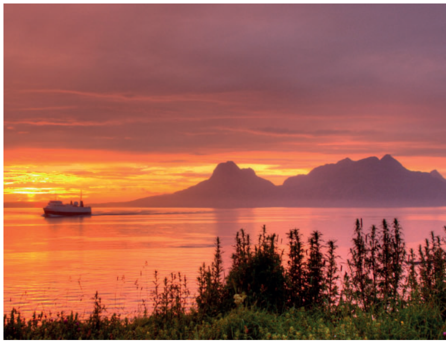
Sunset at Bodo

The city of Bodø is an excellent base from which to explore some of Norway's best