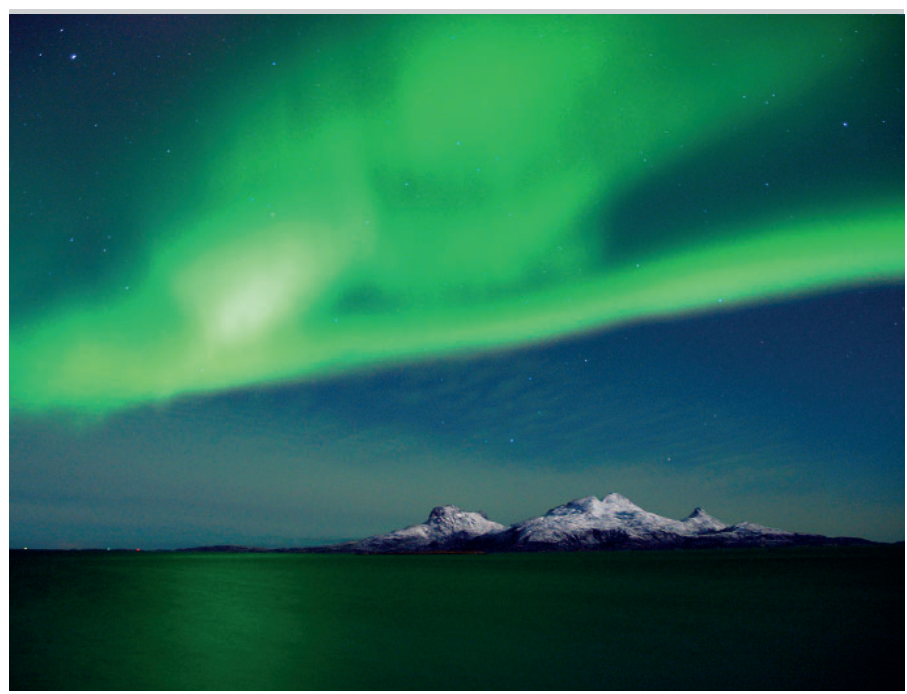
Northern Lights

Trondheim • Bodø • Svolvaer • Harstad • Tromsø