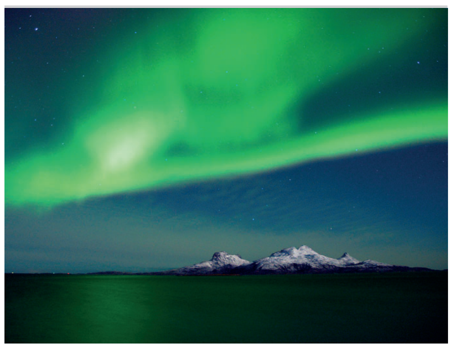
Northern Lights

Trondheim • Bodø • Lofoten Islands • Senja • Alta • Karasjok • Kirkenes • Tromsø