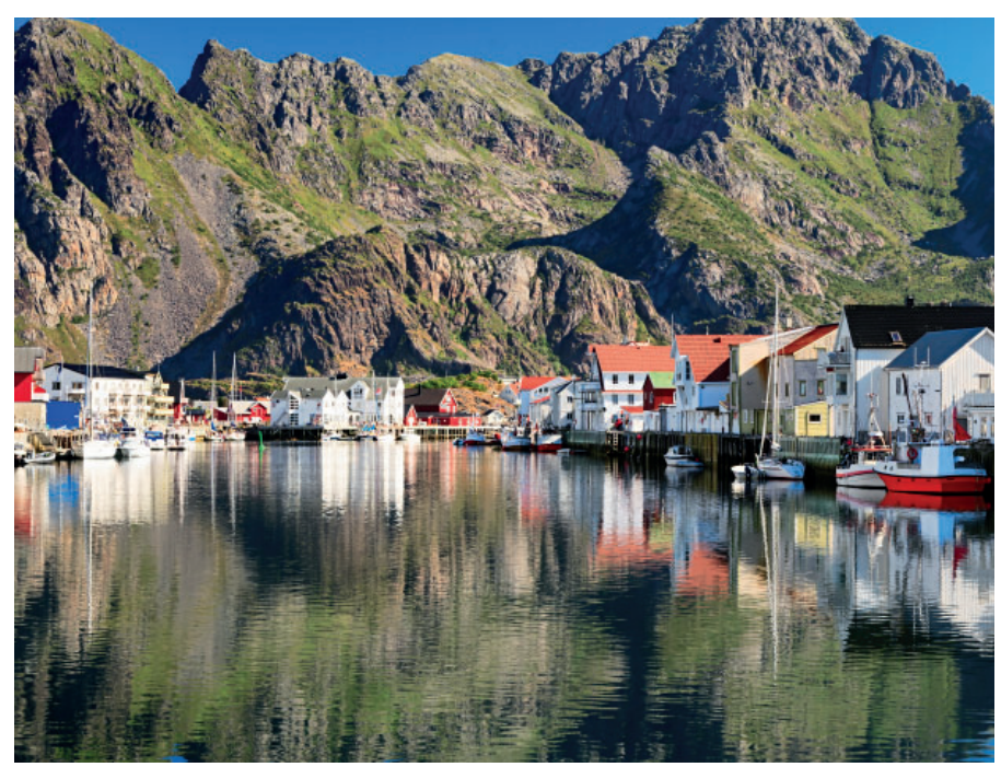
Henningsvaer Lofoten Islands

After one night on the island of Senja you will drive further into the heart Arctic Norway to Alta, a journey of around six hours. Start by driving along the coast of Senja, skirting the beautiful Anderdalen National Park. You will cross back to mainland Norway at Silsand, arriving into the small town of Finnsnes. Continue along the coast, passing small harbours and quaint boating houses. You will then head further inland, passing through small towns and villages interspersed with dense forest, before skirting the edge of the remote lake of Finnfjordvatnet. As you proceed further north the settlements become less frequent and the mountains become bigger. One of the visual highlights of this journey will be when you join the Northern Lights route, driving along the length of the Lyngenfjord. You will head briefly away from the fjord to travel down remote lanes hemmed in by mountains before heading back to the beauty of the fjord. On the final stretch of the journey more buildings will start to appear again as you draw closer to Alta, also known as the Town of the Northern Lights. Located 375 km above the Arctic Circle, Alta is a small town