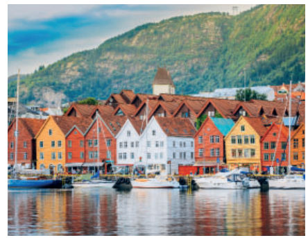
Grand Arctic Norway touring holiday