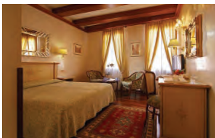
Room at Hotel Bisanzio