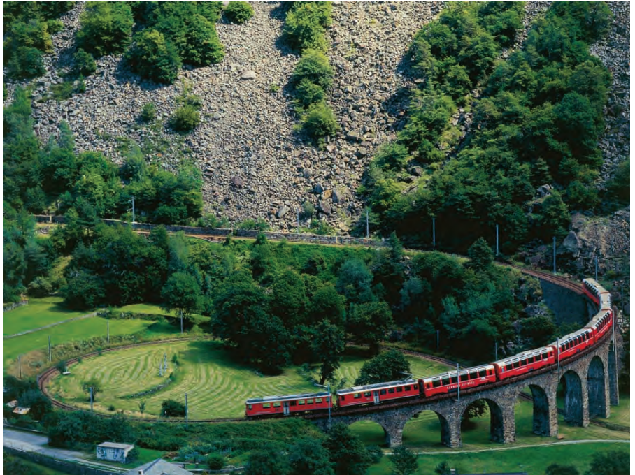
Montebello Curve, Bernina Express

Spend this morning taking in this historic and enchanting city, perhaps stopping at the Grossmunster church and climbing the Karlstrum tower. Leave Zurich at lunchtime to travel to St Moritz, where you arrive at about 4pm. The first leg of the journey by train takes you along the edges of Lakes Zurich and Walensee to Chur. In Chur you change trains and continue along the first part of the Bernina Railway further into the mountains to the resort town of St Moritz. Spend two nights in St Moritz at the Hotel Schweizerhof.