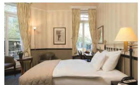
Room at Hotel Ambassador a l'Opera