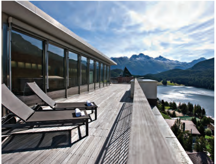
Terrace at Hotel Schweizerhof St Moritz

This luxury five star hotel can be found discreetly tucked away on the Via della Spiga, Milan's most fashionable shopping street, and the Via Montenapoleone, the cathedral and famous La Scala theatre are a short distance away. Inside, discover an intimate and sophisticated atmosphere with marble floors and dark wood wall panels. The hotel provides outstanding levels of service and facilities, including the historic Il Baretto al Baglioni Restaurant which serves national dishes with Mediterranean influences.