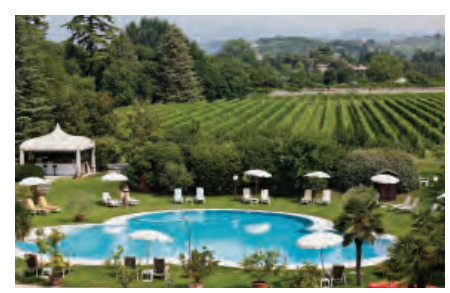
Swimming pool at Villa del Quar