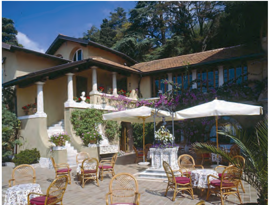
Villa del Sogno, terrace

This is a captivating hotel perched above the lake, offering comfortable and luxurious accommodation in attractive surroundings. The hotel is surrounded by a beautiful park, whilst guests can admire the views across the deep blue waters from the large terrace. The rooms are divided between the original villa and the newer extension beneath the villa, where the style is much more modern and many rooms are equipped with balconies. The hotel's restaurant, the Maximilian, offers guests the choice to eat in the plush dining room or outside on the terrace whilst the garden bar offers lunch and light snacks by the pool.