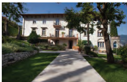
Belvue San Lorenzo, exterior