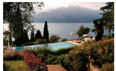
Belvue San Lorenzo, pool and gardens