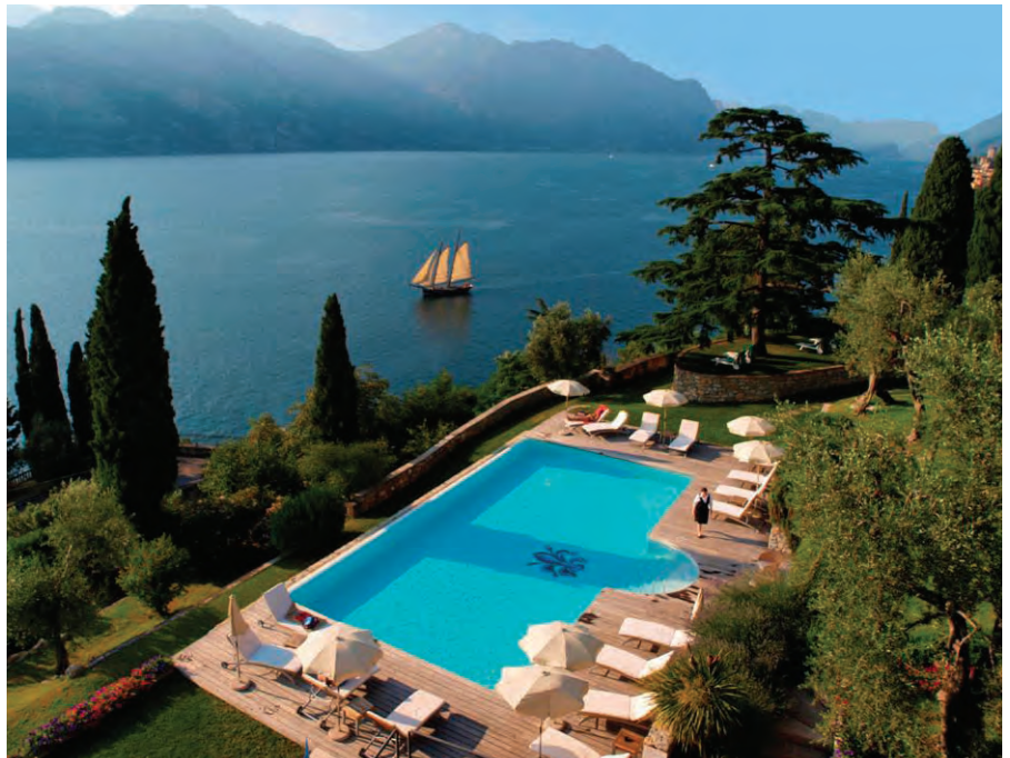
View of Lake Garda from Hotel Bellevue San Lorenzo

After checking out of your hotel, a car will take you back to Verona station where you catch an overnight sleeper train to Paris, departing at about 9.30pm.