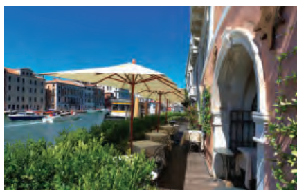
Ca'Sagredo Hotel, Venice