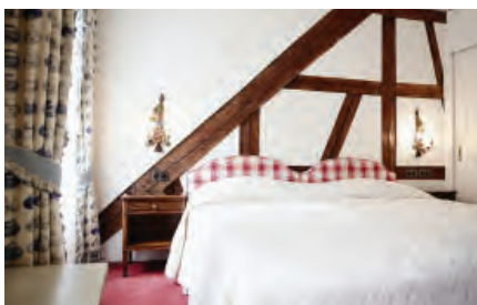
Wilden Mann, Lucerne

This luxury five star hotel can be found discreetly tucked away on the Via della Spiga, Milan's most fashionable shopping street, and the Via Montenapoleone, the cathedral and famous La Scala theatre are a short distance away. Inside, discover an intimate and sophisticated atmosphere with marble floors and dark wood wall panels. The hotel provides outstanding levels of service and facilities, including the historic Il Baretto al Baglioni Restaurant which serves national dishes with Mediterranean influences.