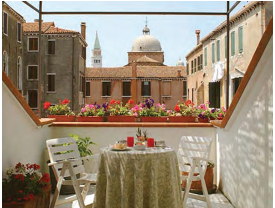
Hotel Bisanzio, Venice

Ca'Sagredo Venice sits majestically on the banks of the Grand Canal in Venice. With only 42 rooms and suites, the grand public areas of Ca'Sagredo make up a large proportion of the hotel and include marble staircases and beautiful frescoed halls. The elegant guest rooms at Ca'Sagredo are each unique and combine traditional Venetian decoration with some contemporary touches. Enjoy Venetian cuisine and local wines while whilst overlooking the Grand Canal from the panoramic terrace at the L'Alcova Restaurant or a drink in L'Incontro, the atmospheric bar. The Ca'Sagredo hotel is just a short walk away from St Mark's Square, the main museums and the best fashion boutiques.