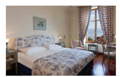
Superior lake view room at Hotel Angleterre et Residence