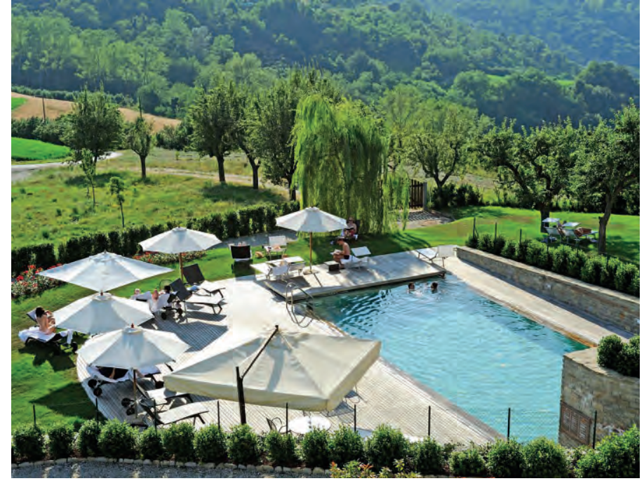
Swimming pool at Villa d'Amelia

It is possible to add extra nights in any of these destinations if you would like to spend more time there.