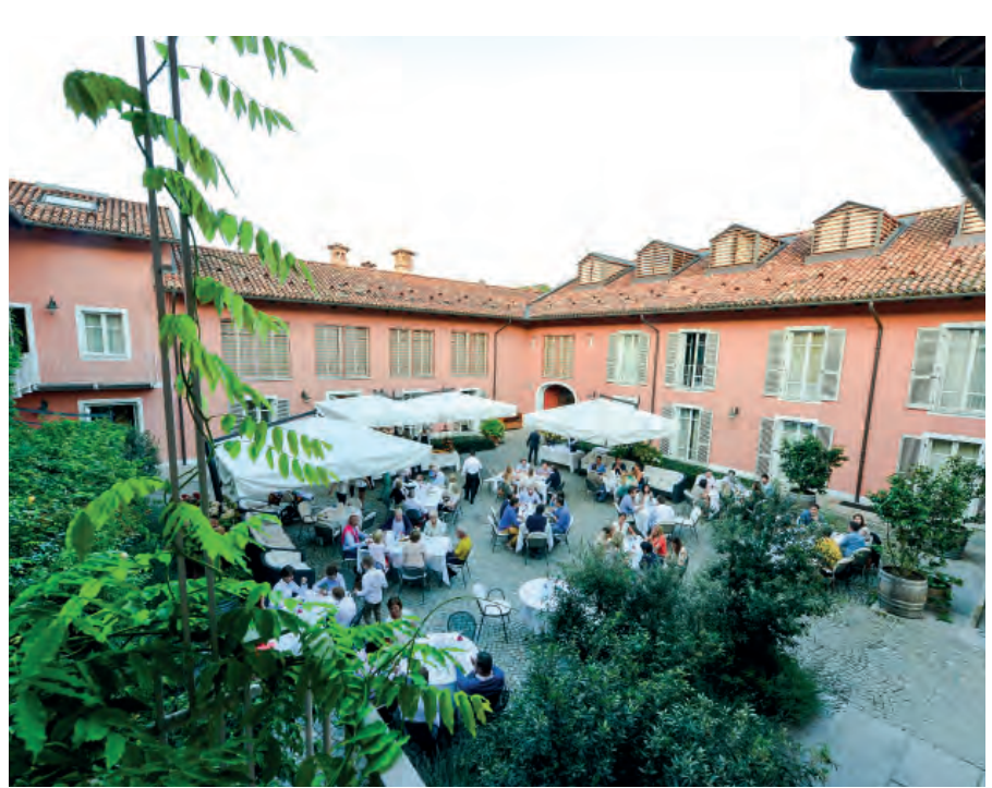
Terrace at Villa d'Amelia

On the shores of Lake Geneva with stunning views of the Alps, this hotel comprises of five different buildings surrounding the main Reception. The hotel offers contemporary style in a historic setting with parts of the buildings dating back to the 18th century. The 75 bedrooms and Junior Suites are scattered between four buildings, each with their own distinct styles, but all guests will benefit from the same high standards of care from the friendly, professional staff.