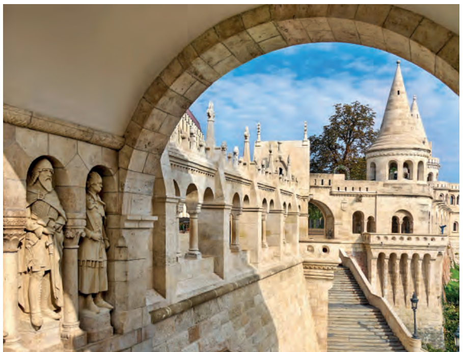
Fishermen's Bastion, Budapest

Opera House where you can experience a guided tour or an opera performance. On two-mile long, tree-lined Andrássy ut you will find elegant shops and houses, Heroes Square and the Museum of Fine Arts. The thermal springs of Budapest have been enjoyed since Roman times and baths are to be found in both Buda and in Pest, where the Szechenyi Baths are one of the largest bathing complexes in Europe, with outdoor and indoor pools, built in modern Renaissance style.