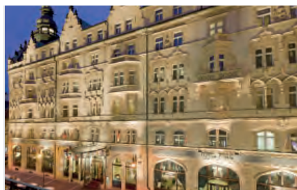
Hotel Paris, Prague