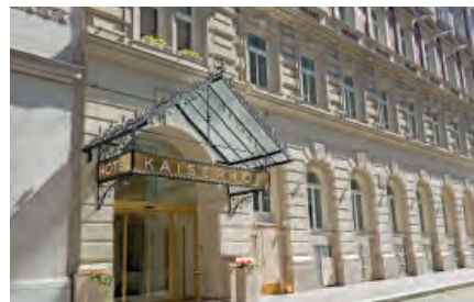
Hotel Kaiserhof, Vienna

House. The hotel is family-owned and enjoys 74 comfortable rooms and suites.