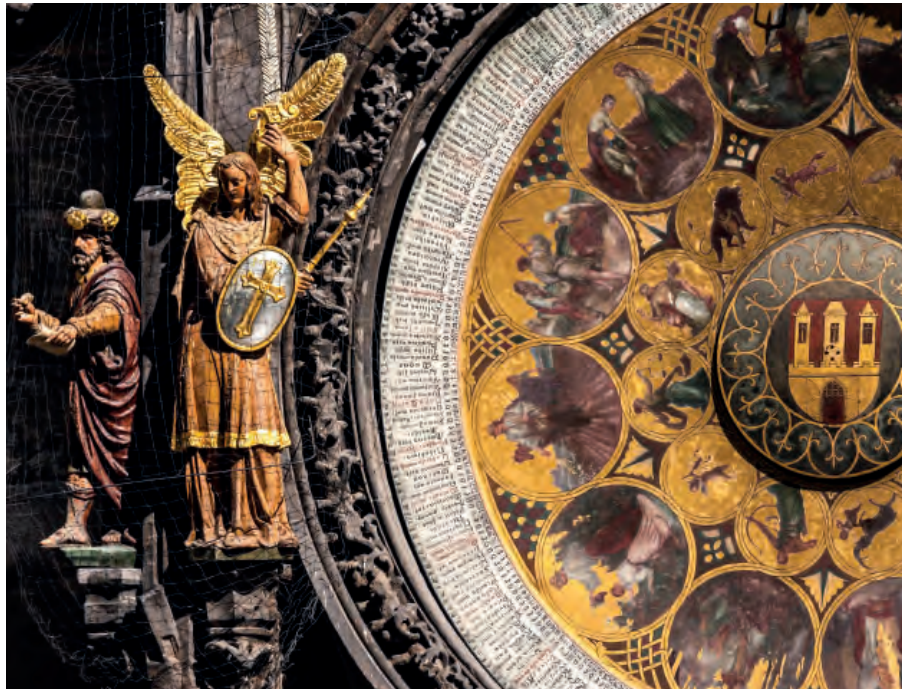
Astronomical clock, Prague

This luxury rail touring holiday encompasses a trio of central European cities: Prague, Vienna and Budapest. Each city bears witness to some of the most striking events in the history of Europe and boasts an abundance of fascinating sights and places to visit including imperial palaces, ancient castles and iconic architecture. Each city exhibits its common historic links yet has an incredible character and vibrancy of its own.