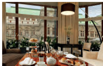
Hotel Bristol, Vienna