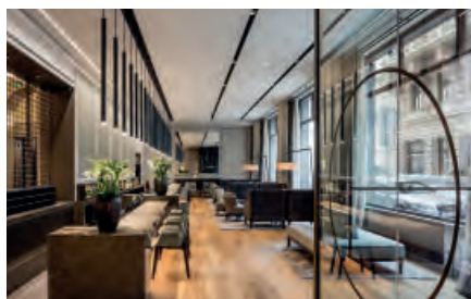
Hotel BoHo, Prague