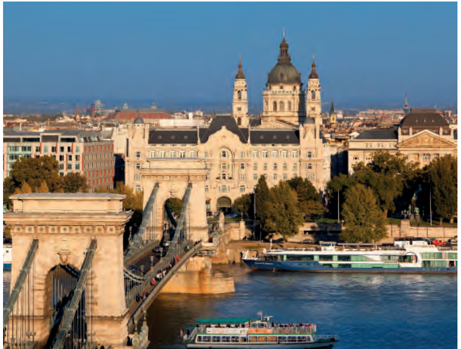
Chain Bridge, Budapest

In Budapest explore the tree-lined boulevards of Pest and the cobbled hilly streets of Buda. The city straddles a curve in the River Danube and is packed with interesting sights to visit on foot but also easily reached by underground. Visit the Castle District in Buda where you can find mediaeval buildings such as the Royal Palace which has been rebuilt several times over the past seven centuries and houses the National Gallery, Budapest Historical Museum and the Museum of Contemporary Art. You can also visit the 13th Century St Matthias Church and the neo-Gothic Fishermen's Bastion nearby. The world-famous Gellert