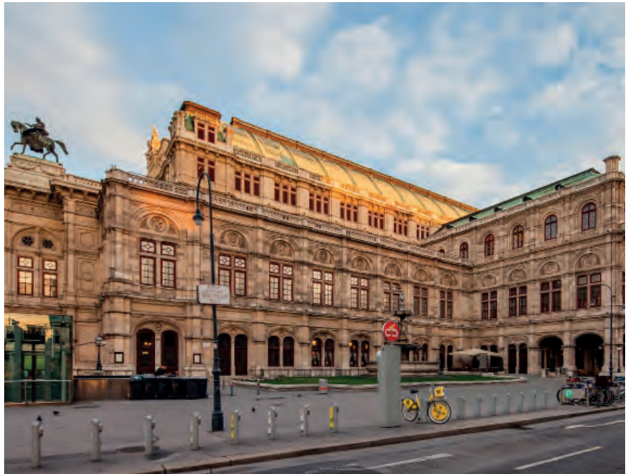
Vienna, Opera House

Either fly back to the UK after your 7-night rail tour or if returning by train, take the overnight sleeper service from Vienna to Cologne, and then a morning train to Brussels and on to London by Eurostar, arriving on what is day ten of the tour.