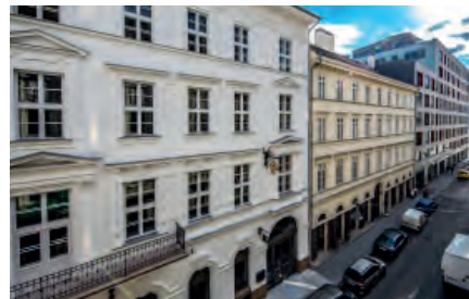
Hotel Prestige, Budapest