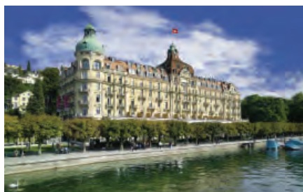
Palace Luzern, Lucerne

Housed within a late 19th century mansion, the Grand Hotel Villa Castagnola channels aspects of Mediterranean culture in its pale-peach façade, its summery garden, and the dining experiences on offer. Guestrooms have wholly unique touches to ensure that every stay here is different, and the swimming pool, lounges, and bars encourage guests to keep returning.