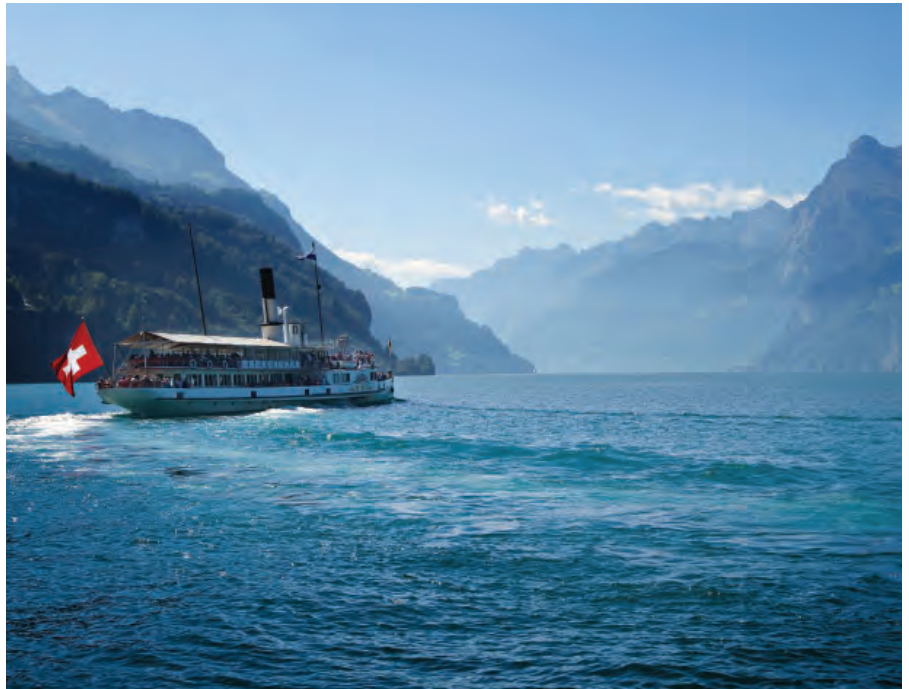
Paddle steamer on Lake Lucerne

Wilhelm Tell, the Swiss National Hero of Liberty, is one of the best known folk characters in Switzerland. Friedrich von Schiller penned the most popular recounting of Tell's fable in his poem, which is still performed in Switzerland more than 200 years later. Begin your touring holiday with a three-night stay in Lucerne, the City of Lights, before boarding the Gotthard Panorama Express on your fourth day. The route of the Gotthard Panorama Express takes you first zig-zagging across Lake Lucerne in your choice of a steamboat or salon motorboat. Pass the iconic locations mentioned in Schiller's poem, including the Rutli Meadows and Tell's Chapel at Sisikon. When you reach Fluelen on the southern-most shore of the lake, disembark and board the train heading to Locarno. The journey south towards the Italian border is lined with snow-capped peaks, interspersed with dramatic valleys, and broken up by a number of historic, picturesque towns. When you reach Bellinzona, change trains for Lugano, where you will spend two nights before heading into Italy for a return flight from Milan, or back north to Zurich for a return flight or train.