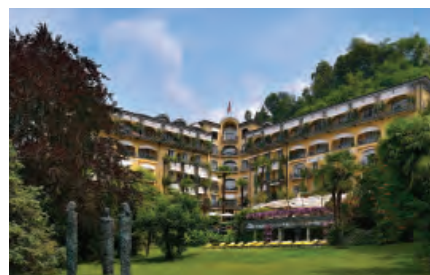
Grand Hotel Villa Castagnola, Lugano