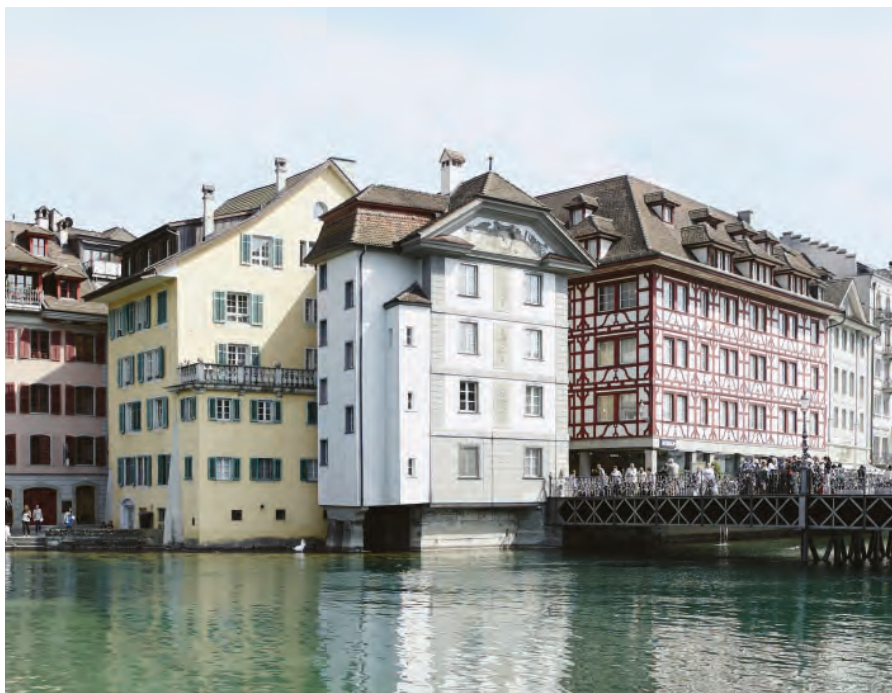
Hotel Wilden Mann, Lucerne

This luxury hotel enjoys a central location on the lakefront close to the historic Old Town. The Schweizerhof has seen many a famous face stay here and is now run by the fifth generation of the family. The hotel offers a wellness and beauty area with stunning views of the lake as well as two on-site restaurants.