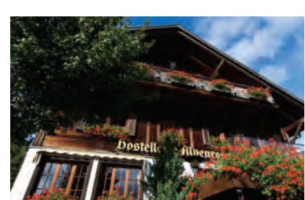
Hotel Alpenrose, Schoenried