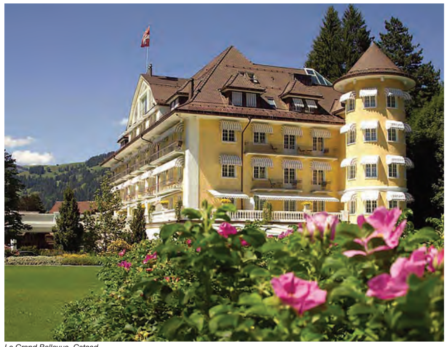
Le Grand Bellevue, Gstaad

Just a short walk from Gstaad's main boutiques, cafes, and restaurants, Le Grand Bellevue is a highly convenient hotel immersed in the picturesque lifestyle of the Saanenland. Its pale yellow façade is palatial in design, with a distinctive tower that shapes some of the hotel suites. Equipped with a Michelin starred restaurant and an indulgent spa, this is a luxurious property in which to spend two or three nights while you explore the Saanenland.