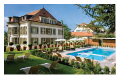
Angleterre et Residence, Lausanne