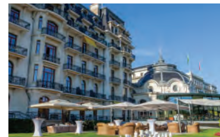
Beau Rivage Palace, Lausanne