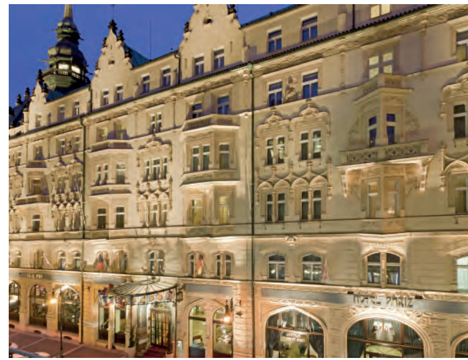
Hotel Paris, Prague

Hotel BoHo is located steps away from the Old Town Square making it an excellent location for exploring Prague, the city of 100 spires. The restaurant offers a range