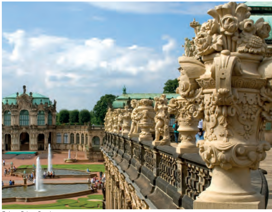
Zwinger Palace, Dresden

Spend your time in Dresden exploring the palaces and historical buildings that the city has to offer. Dresden has a prominent creative scene and is often hailed as the most attractive city in Germany. For history enthusiasts, a visit to Frauenkirche and Neumarkt Sqaure is a must. The Frauenkirche was rebuilt after World War Two and has become a symbol of reconciliation. A fine example of well-preserved Renaissance