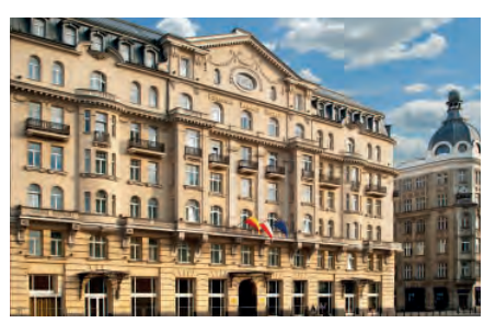
Polonia Palace, Warsaw