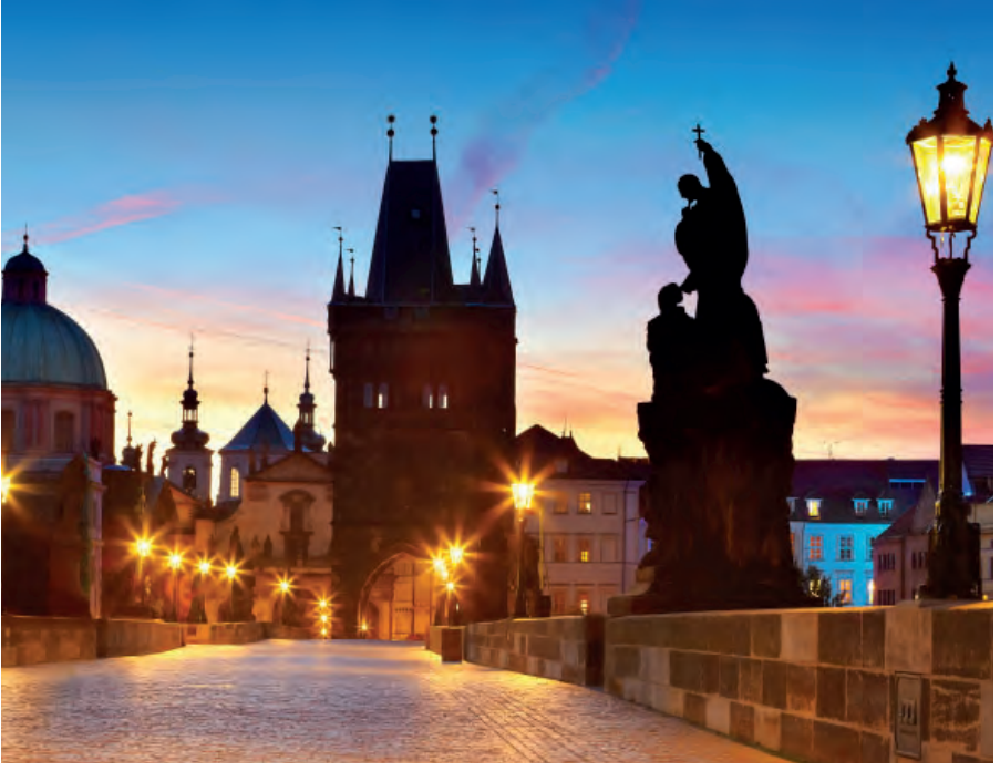
Charles Bridge, Prague

Check out of your hotel after breakfast and travel by rail from Dresden to Prague. The journey will take just over 2 hours. After departure from Dresden, the train runs along the river Elbe (on the left-hand side of the train as you head south). Look out for river boats and the occasional paddle steamer. The last stop in Germany is the pretty spa town of Bad Schandau and the first stop in Czech Republic is Decin where you can observe the Decin