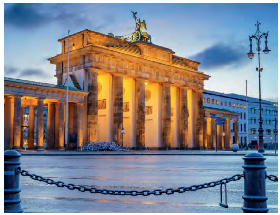
Brandenburg Gate, Berlin

This rail touring holiday links three historical countries, each unique and fascinating in its own way. Begin your rail holiday in Germany, exploring Berlin and Dresden before travelling south to Prague and the ancient capital of Bohemia. Your last destination on this rail touring holiday is Poland, where you can discover the mediaeval streets and splendid, historic buildings of Krakow and the capital Warsaw.