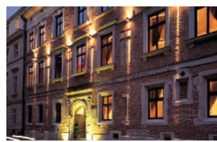
Hotel Copernicus, Krakow