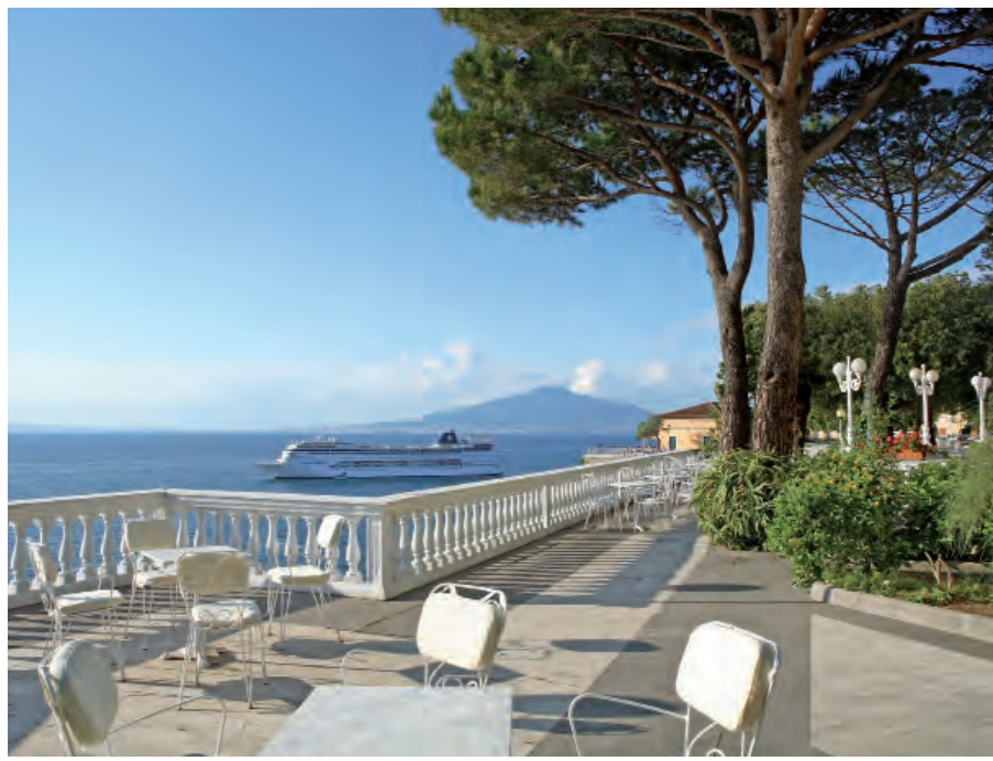
Grand Hotel Cocumella, Sant'Agnello

garden, by the poolside, or on the terrace overlooking the sea.