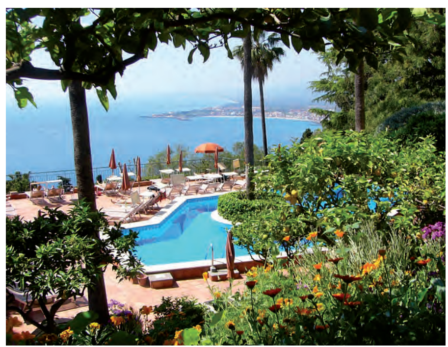
Hotel Villa Belvedere

The Hotel Villa Belvedere is a four-star hotel located centrally near the botanical gardens of Taormina, perched on a hill-side affording beautiful views of the coast and the countryside towards Mount Etna. Occupying an historic Sicilian villa, the Villa Belvedere offers comfortable accommodation in good sized bedrooms, some of which have a balcony with tables and chairs. The bedrooms are simple but pleasingly equipped, with wi-fi throughout. There is a small, prettily furnished lounge with paintings and comfortable chairs, a cosy bar area nearby and on the floor below, a breakfast room. Outside there is a sun terrace and swimming pool accessible through terraced luxuriant gardens of tropical plants and bougainvillaea, above which tower immense palm trees. On the terrace by the pool, tasty light lunches are served. The Hotel Villa Belvedere can also arrange for you to join local excursions to all the major sites and places of interest.