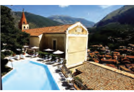
a Locanda delle Donne Monach