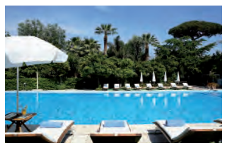
Grand Hotel Cocumella

Poised on the cliffs above Tropea's shores, Villa Paola is a five-star hotel with beautiful surroundings. Whilst areas of the hotel's structure date back to 1543, its traditional dark red and cream exterior and colourful flowers of the gardens give an attractive and almost contemporary appearance. Inside, the hotel is a careful blend of modern decoration and historical, traditional features. Perhaps the best example of this is the ancient cloister which is now a lounge and library, the ideal area for peaceful relaxation. The 11 bedrooms at the hotel are very light and offer views of the sea or beautiful gardens. The hotel's high ceilings make the rooms feel incredibly spacious, whilst an accent colour of deep purple adds an element of subtle luxury. There is an abundance of colour in the hotel's garden with green lawns and flowers of pinks, blues and whites. An outdoor swimming pool with a Jacuzzi is found in the garden whilst the solariums make good use of the hotel's coastal location. The hotel's terrace offers panoramic views of the sea and surrounding cliffs and is the ideal place to relax outdoors. There is also a Thalassotherapy Wellness Centre belonging to the hotel which lies 7 miles away. Ideally placed for days wandering down to Tropea's beach, Villa Paola offers a comfortable stay with helpful staff in a beautiful location.