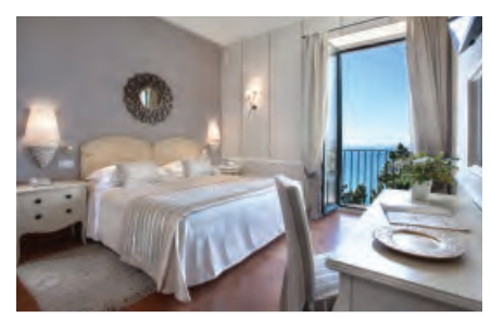
Hotel Villa Belvedere