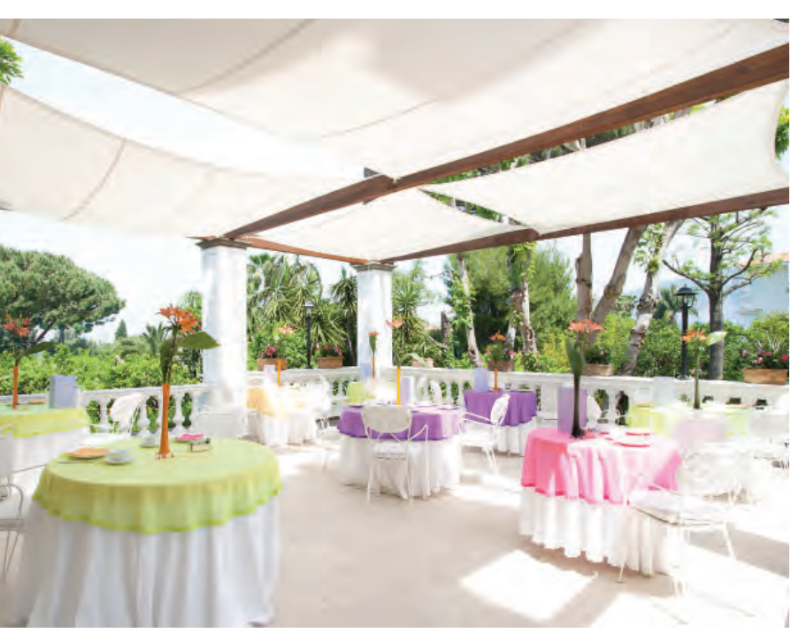
Grand Hotel Cocumella