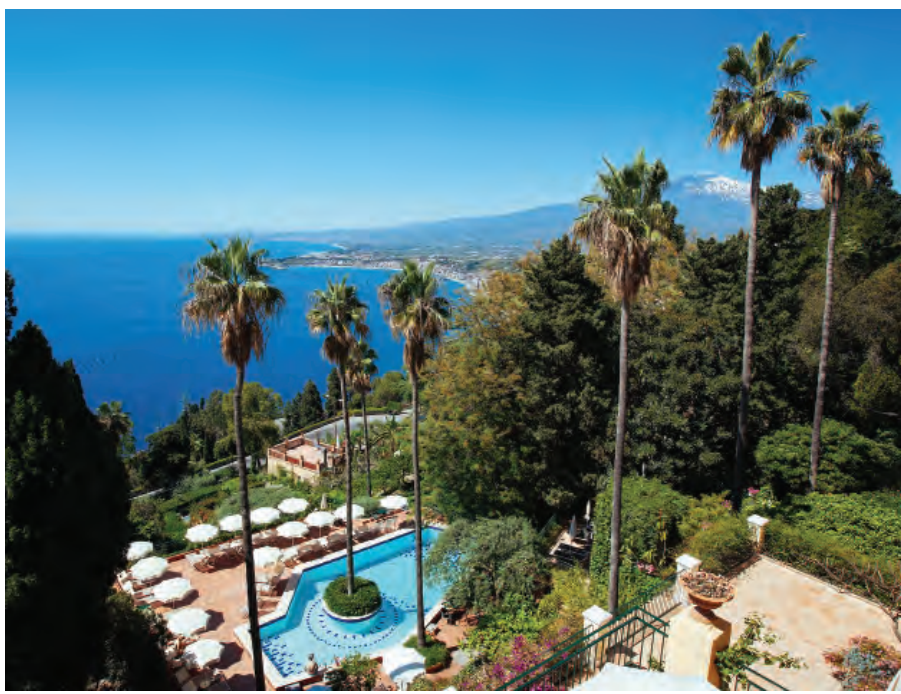
Hotel Villa Belvedere, Taormina