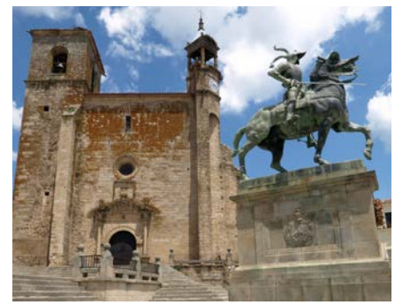
A grand tour of Spain