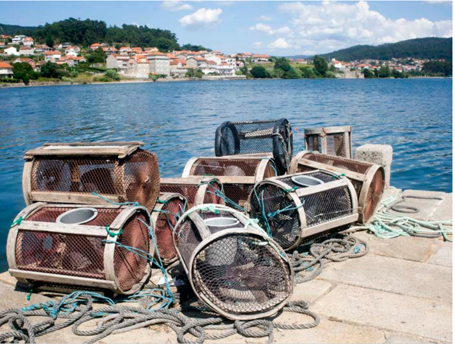
Pontevedra on the Rias Baixas