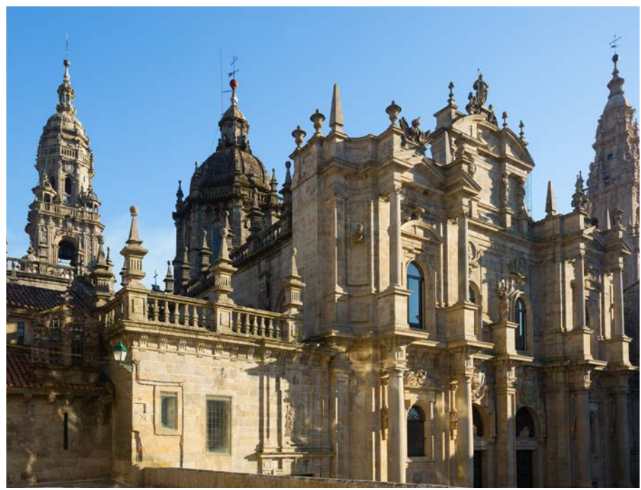
Santiago de Compostela

Lerma to León by car: 2 hours León to Santiago de Compostela by car: 3 hours 30 minutes